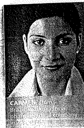
CARMEN wants to travel to Brazil and she needs to check the requirements for the UK Embassy in Brazil.

check-up insurance scheme national health service